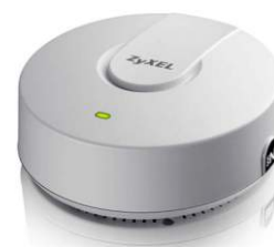
Zyxel NWA 5121-NI

The ZyXEL NWA5120 Series 802.11 a/b/g/n Unified Access Point is a highly future-proof WLAN solution perfect for growing business, hospitality and education environments