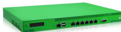
Nomadix AG 5800