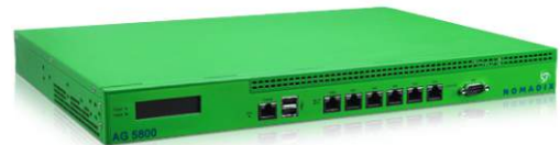
Nomadix AG 5800