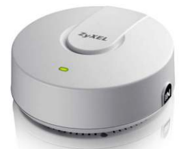
ZyXel NWA 5121-NI

The ZyXEL NWA5120 Series 802.11 a/b/g/n Unified Access Point is a highly future-proof WLAN solution perfect for growing business, hospitality and education environments